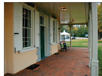
Front of ground-level porch of Belmont Mansion

QUEST FOR FREEDOM —Quilt Workshop and Quilt Exhibit Tour. March 29, 1–3:00 pm. Admission: $ 7 . 0 0