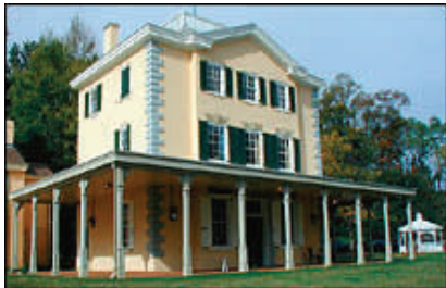
Front exterior of Belmont Mansion.

The Underground Railroad Legacy Series is presented by the